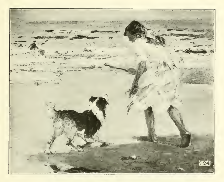
RETRIEVING, BY Edward H. Potthast